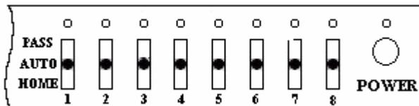
8-Channel Video switcher ( example )